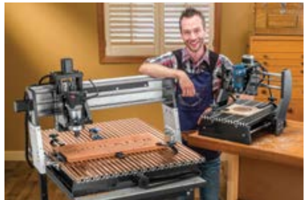
6. Rockler 60th Anniversary Edition CNC Shark (#58886) $3999.99