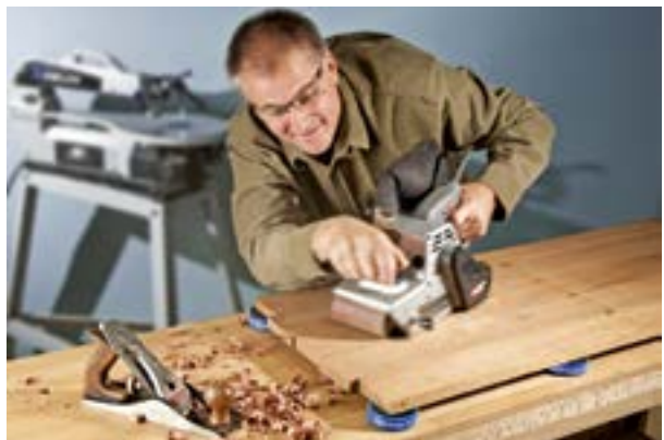
2. Bench Cookie Plus Work Grippers (#46902) $12.49