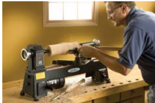
1. Excelsior Mini Lathe (#33207) Sale $199.99 (Now – 12/25) Reg $299.99