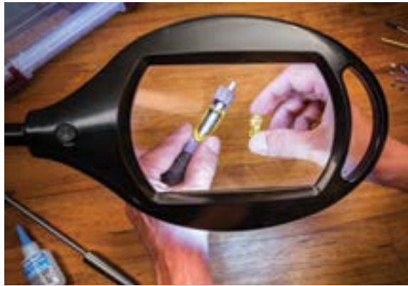
4. Magnifying LED Work Light (#57312) – Sale $59.99 (Now – 12/25) Reg $99.99