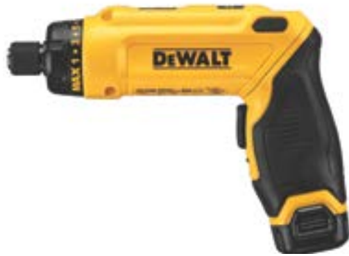
3. DeWalt 8V Max Gyroscopic Screwdriver Kit (#58467) $99.99